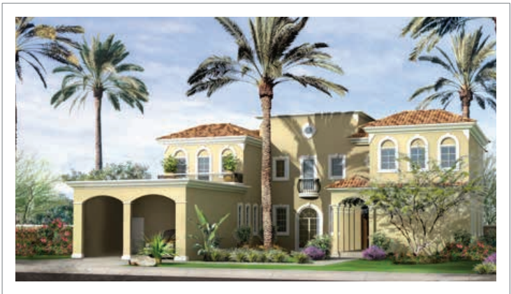
Villa Type C 7 Bedrooms Total Area: 6207 Sq Ft

Note: Room dimensions shown are in feet and total area in square feet. All materials, dimensions and drawings are approximate. Actual usable floor space may vary from the stated floor plan. The developer reserves the right to make revisions to the floor plans. E&OE