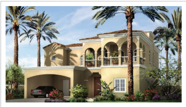
Villa Type B3 5 Bedrooms Total Area: 4317 Sq Ft

Note: Room dimensions shown are in feet and total area in square feet. All materials, dimensions and drawings are approximate. Actual usable floor space may vary from the stated floor plan. The developer reserves the right to make revisions to the floor plans. E&OE