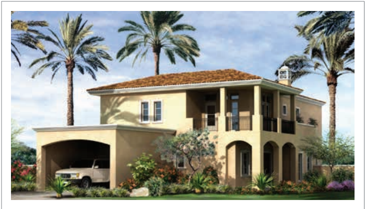
Villa Type B2 5 Bedrooms Total Area: 4628 Sq Ft

Note: Room dimensions shown are in feet and total area in square feet. All materials, dimensions and drawings are approximate. Actual usable floor space may vary from the stated floor plan. The developer reserves the right to make revisions to the floor plans. E&OE