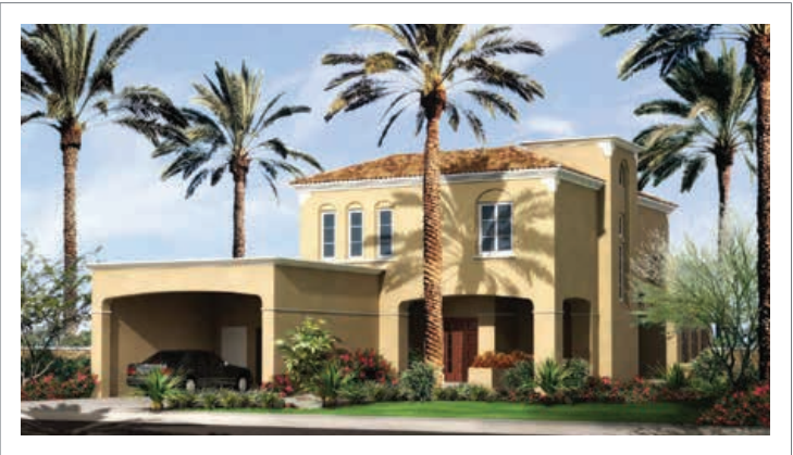
Villa Type A 4 Bedrooms Total Area: 3673 Sq Ft

Note: Room dimensions shown are in feet and total area in square feet. All materials, dimensions and drawings are approximate. Actual usable floor space may vary from the stated floor plan. The developer reserves the right to make revisions to the floor plans. E&OE