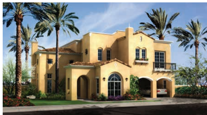
Villa Type B1 5 Bedrooms Total Area: 4659 Sq Ft

Note: Room dimensions shown are in feet and total area in square feet. All materials, dimensions and drawings are approximate. Actual usable floor space may vary from the stated floor plan. The developer reserves the right to make revisions to the floor plans. E&OE